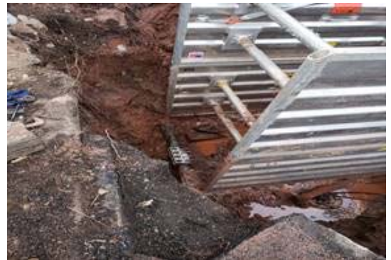
2 Sutherland with a new and proper repair clamp in place. Note street cut and fairly recent asphalt patch from the last repair.