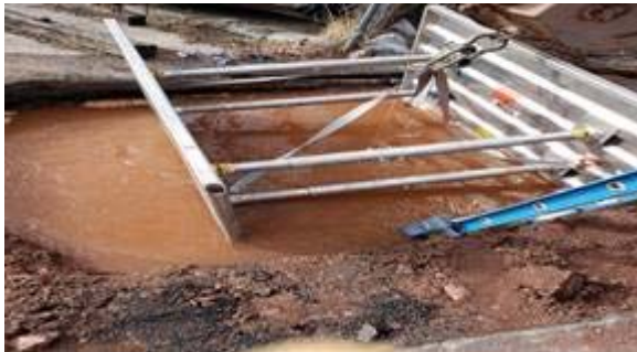
2 Sutherland Place water main leak

The Water/Sewer crew was out late two nights in a row making these back to back repairs, and they have been putting in a lot of long hours this month with several water leak and sewer main issues and repairs. Their hard work is GREATLY APPRECIATED!