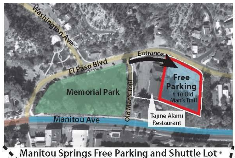
Manitou Springs Free Parking and Shuttle Lot *

A route map is available through Mountain Metropolitan Transit at www.mmtransit.com and on the Manitou Springs City website. More specific schedule information is available by using the My Next Bus? sign posted at each stop.